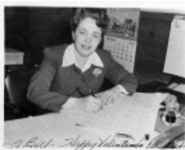
Happy Valentine’s Day photo 1944